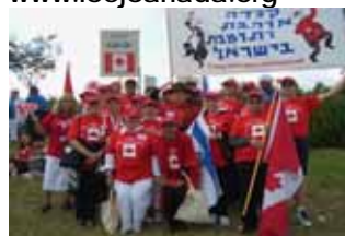
"The Feast" Canadian Delegation in Israel Jerusalem March

Plan on this being the year to go to Israel! Ask how you can go free! Next Trip: October 3-14 th [opt extension to 17 th ] "The Great Hosanna" See enclosed flyer for details and our website: www.icejcanada.org